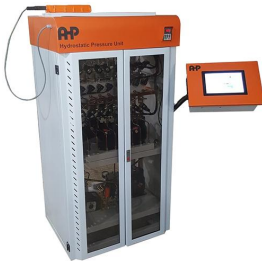
Hydrostatic Pressure Tester