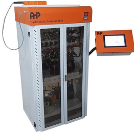
Hydrostatic Pressure Tester